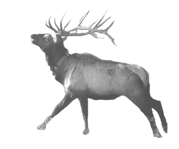
April 5-6, 2004 Prosser, WA